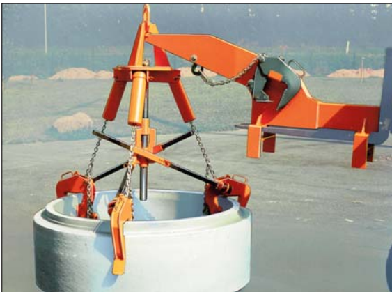
RGA-300 with cantilever KA-300 for the automatic fork lift transport