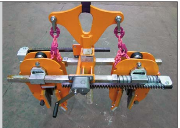
Pipe Grab RG 3,5 with simultaneous, stepless adjustment to the inside diameter via rack jack winch