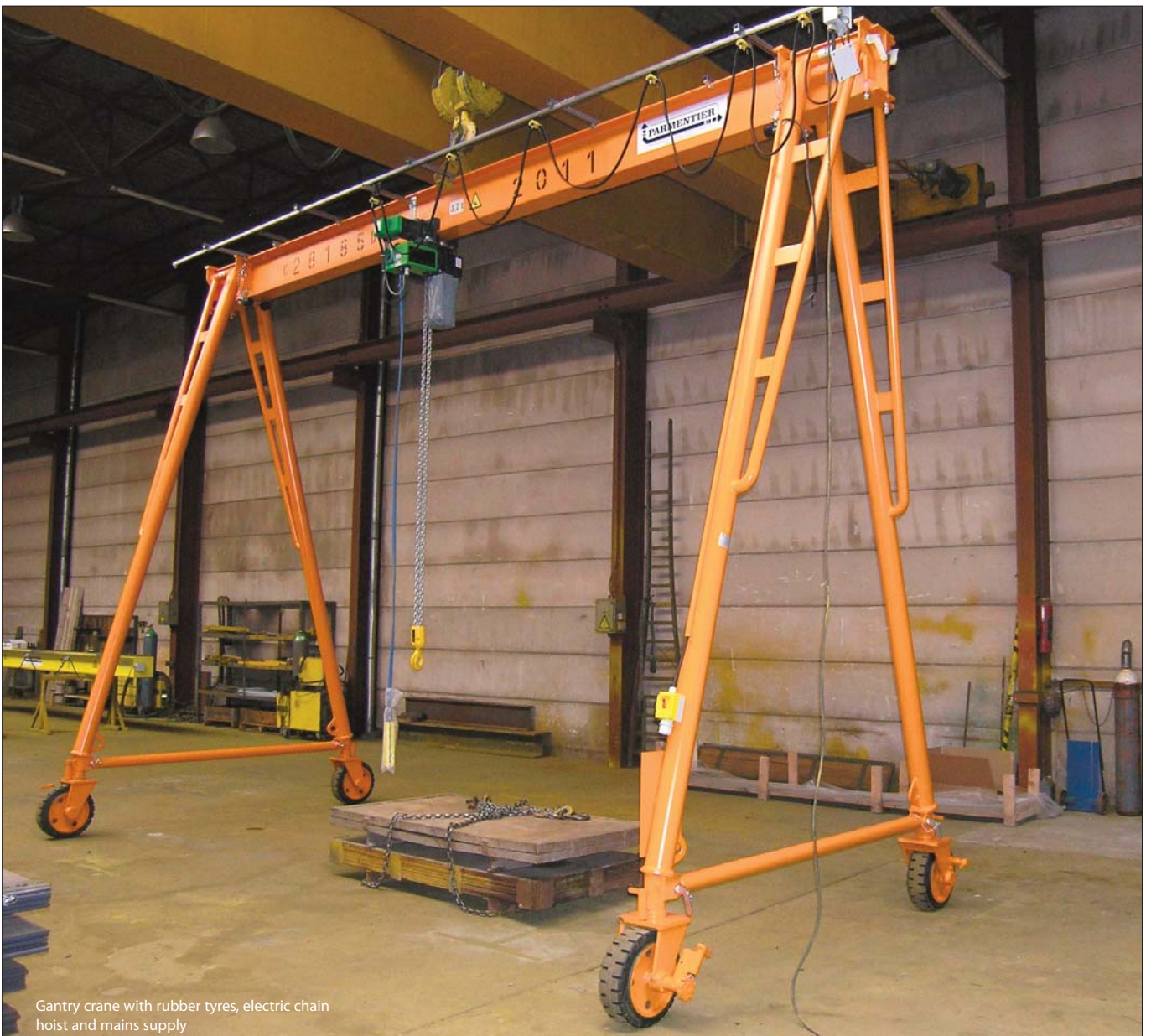
Gantry crane with rubber tyres, electric chain hoist and mains supply